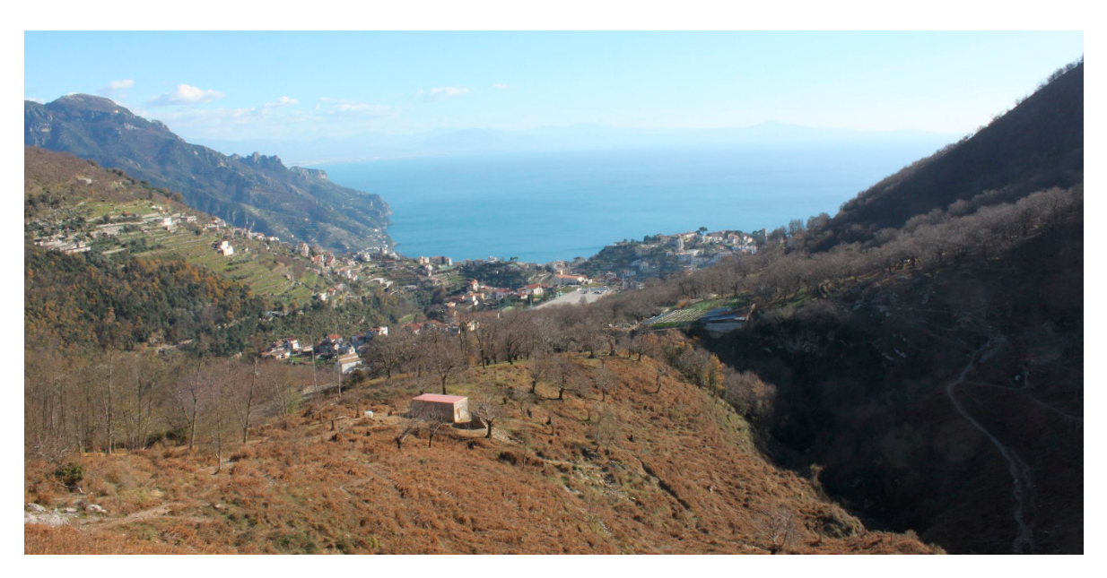
Figure 2. The pre-protohistoric sites of the Amalfi Coast are hidden in the landscape: a Bronze Age site has been identified on the plateau in the foreground.

Starting from the research, it will be possible to obtain a complete enhancement of the prehistoric archaeological heritage of the Lattari Mountains-Amalfi Coast, capable of combining correct communication of knowledge of the prehistory of the area and the effective use of the related contexts/sites, mostly located in a mountain environment and characterized by low attractiveness, as they are hidden in the landscape (Figure 2).