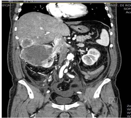
Figures 1: Preoperative CT scan: Coronal reconstruction showing the renal mass, VI segment liver invasion and IVC thrombus.