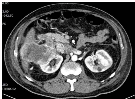
Figures 2: Preoperative CT Scan: Axial reconstruction showing the renal mass, head of the pancreas and duodenal invasion and IVC thrombus.

inferior vena cava for a length of about 6 cm. Chest: a solid formation of about 9 mm is observed at the apical segment of the LSD, strongly suspected by secondary location of the disease, not further solid lesion on both lungs. An esophagogastroduodenoscopy was performed and revealed the following: at the level of the second portion of the duodenum is hardly noticed a protruding tumefaction in the lumen, ulcerated at the top; the tumefaction reduced dramatically the lumen of the bowel (Figure 3). A transesophageal echocardiography revealed no evidence of thrombotic formation in the right atrium and in the explorable tract of the caval veins. EF 40/45% (slightly reduced), VS of normal volumes and dimensions. Lee's Index Score =2 (low <2, intermediate =2, high >2).