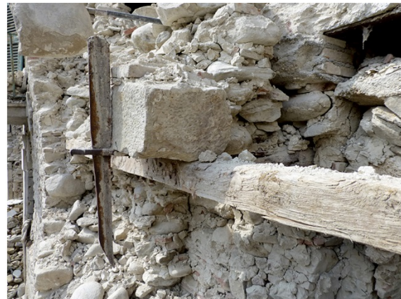
Fig. 7. Iron wall anchor of timber tie, Amatrice, via Roma. a) General view; b) Close up of a wall anchor.