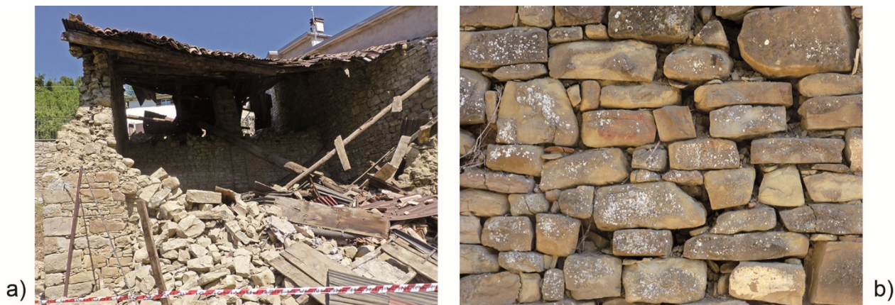
Fig. 12. Masonry disintegration due to poor quality mortar in a reasonably accurate units' assemblage of the external leaf. Amatrice, Cossito: a) Front view, b) detail of masonry on the left-lateral wall.