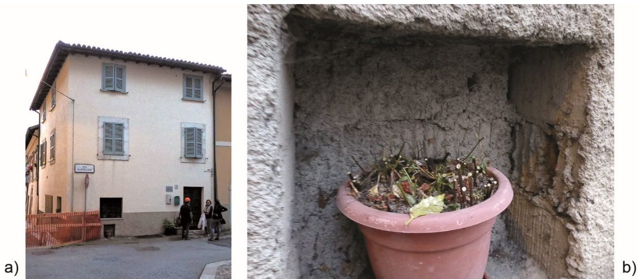
Fig. 19. Demolished and rebuilt plastered clay block masonry. a) General view, b) close up of a cavity, with clay block visible. Norcia, via Anicia intersection with via Cappellini.