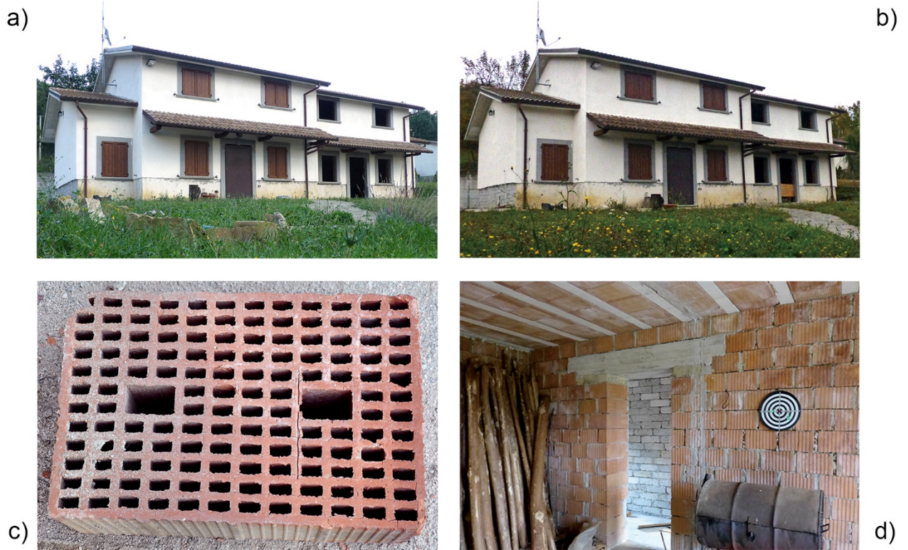
Fig. 20. Clay block masonry building. a) After the 24 th August event, b) after the 30 th October event, c) close up of a block, d) view of bare wall and floor. Amatrice, San Capone.