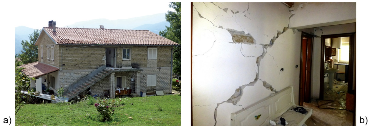
Fig. 22. Solid concrete block masonry (ground floor) and tuff masonry (first floor) building. a) External view, b) Internal view at first floor above ground. Accumoli, Illica.