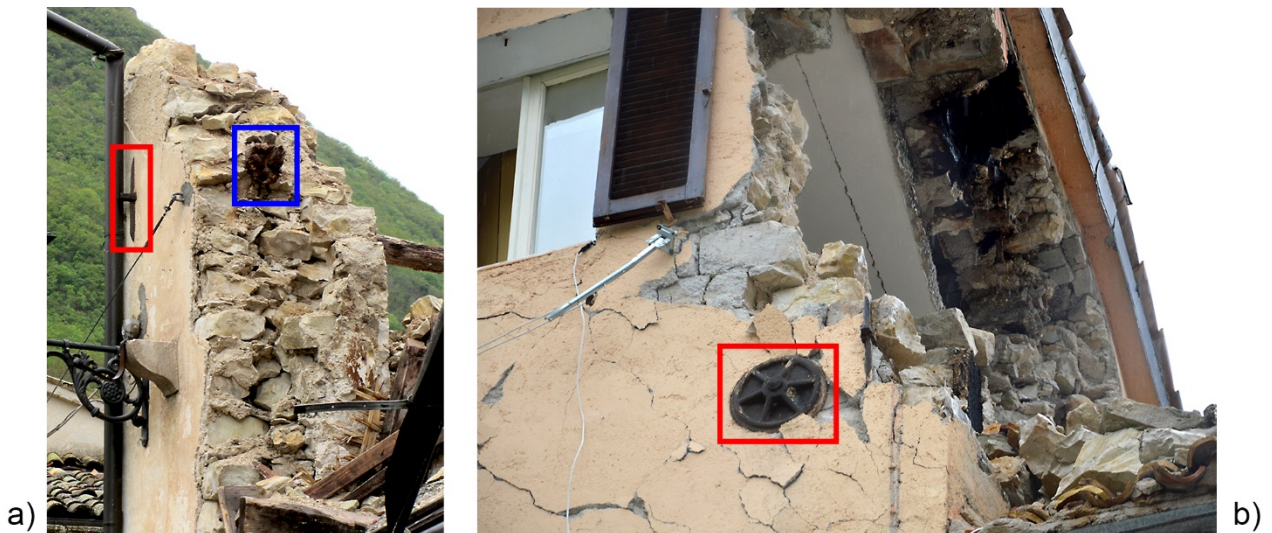
Fig. 4. Timber tie rods (blue frame) and steel wall anchors (red frame) in Castelsantangelo s/N: a) Via Parco della Riformazione, b) via delle Mura Castellane.

The municipalities of Arquata d/T and Norcia have been slightly involved by the 1997-1998 Umbria-Marche sequence. From the surveys performed at that time it is possible to gain additional information about their building features. Approximately three quarters (half) of buildings in Arquata d/T (Norcia) have unreinforced stone masonry structures and about one fifth (one third) of the floor diaphragms are rigid. Timber and/or steel tie rods are present also in Castelsantangelo s/N (Fig. 4), although in a less systematic way than in Norcia. In Castelsantangelo buildings are mostly characterised by a rubble stone masonry with two leaves, not always well connected.