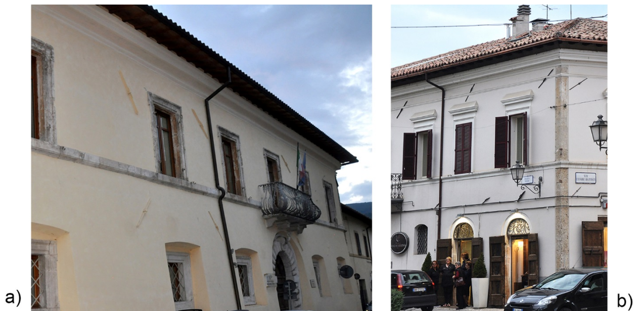
Fig. 3. Norcia. Two-storey buildings, tapered wall thickness, systematic use of tie rods. a) via Cavour, b) piazza Giuseppe Verdi.

In 1979 Norcia has been hit by another earthquake, but damage was located in different portions of the historical centre compared to 1859 (Reale et al. 2004). This difference indicates that repaired buildings performed satisfactorily but also that the demolition of historical buildings to create the space for the new avenue, corso Sertorio, produced façades not connected adequately to pre-existing structures.