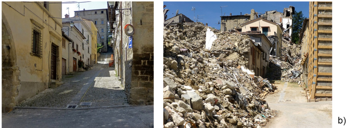
Fig. 10. Damage accumulation in Accumoli, via Tito Vespasiano: a) After August 24 th , b) After October 30 th .

to water percolation. Previous studies in seismic contexts, carried out on mortar samples collected in Onna, Tempera and Sant'Eusanio Forconese, all located near L'Aquila (Artioli et al. 2010; Artioli et al. 2011), also revealed the possible presence of clay, but in a smaller percentage of samples, and with smaller fractions, than those found in the area of Amatrice.