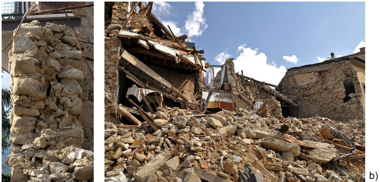
Fig. 11. Poor performance of undressed natural stone buildings in: a) Accumoli, Illica and b) Amatrice, corso Umberto I.