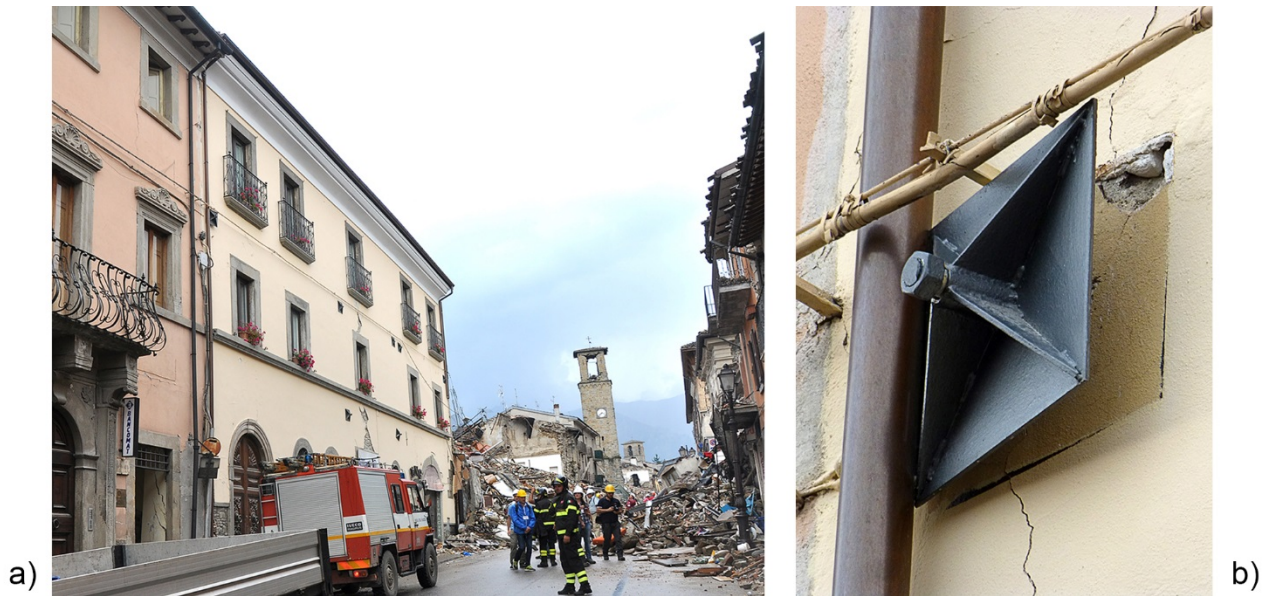
Fig. 8. Steel tie rods in the lightly coloured building, Amatrice, corso Umberto I. a) General view; b) Close up of a wall anchor.