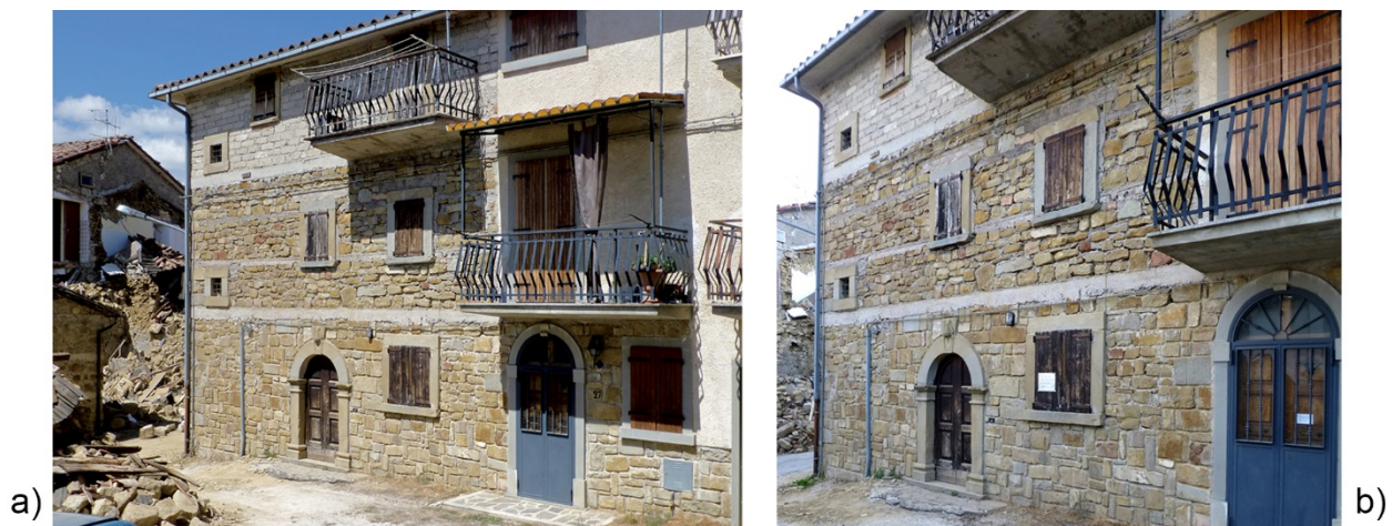
Fig. 17. Demolished and rebuilt natural stone masonry, resorting to modern mortar and ring beams. Amatrice, San Capone. a) Post 24 th August; b) Post 30 th October.

A somewhat similar example is that in Fig. 19a, located in the very historical centre of Norcia. The building seems a typical vintage construction, but its plaster finishing covers a hollow clay block structure (Fig. 19b) as a result of a mid 1980s demolition and reconstruction. Interventions such as those just documented have been considered in the past as unacceptable, but the extremely poor performance of entire historical centres and the very high toll in terms of lost human lives suggest that a general reconsideration is necessary. Preservation of environment values (shape and surface aspect of the buildings), while internal structure is replaced, should not be considered out of question, both in the case of collapsed buildings as in the case of documented very poor characteristics of masonry in slightly damaged buildings.