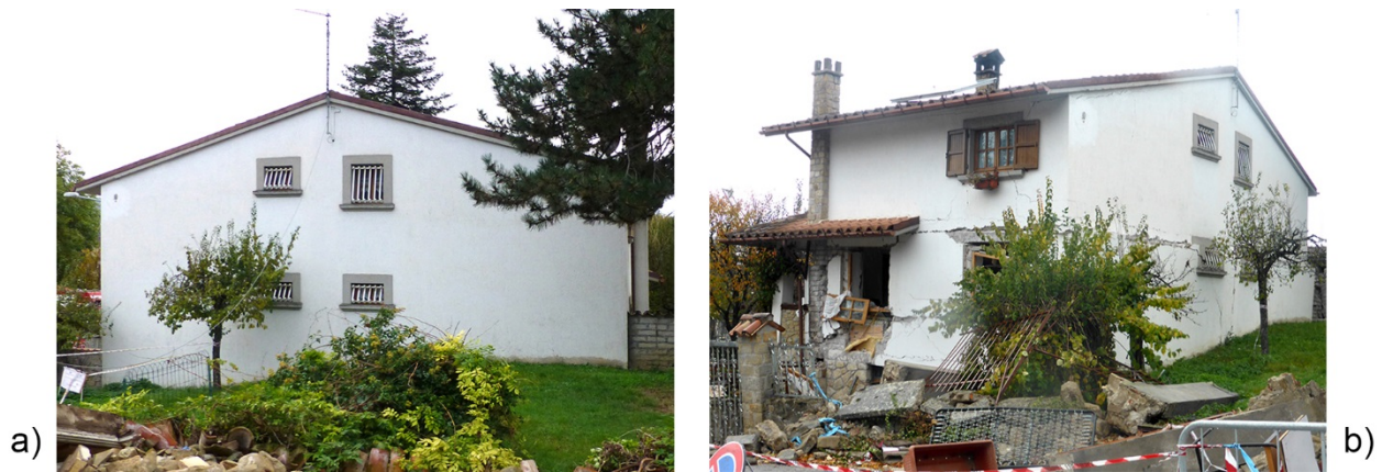
Fig. 21. Solid concrete block masonry building. a) After the 24 th August event, b) after the 30 th October event. Amatrice, viale Saturnino Muzii.