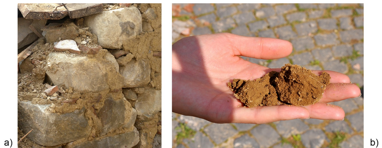
Fig. 5. Mud mortar in: a) Accumoli, Illica, and b) Amatrice, Sant' Angelo.