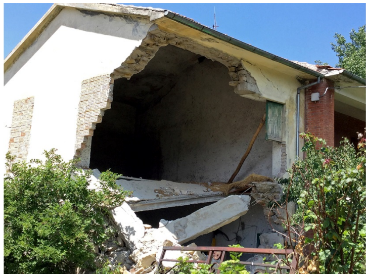
Fig. 6. a) I-beam and hollow clay block floor, Amatrice, Retrosi; b) Precast reinforced concrete beams and hollow clay block floor, Amatrice, Moletano.