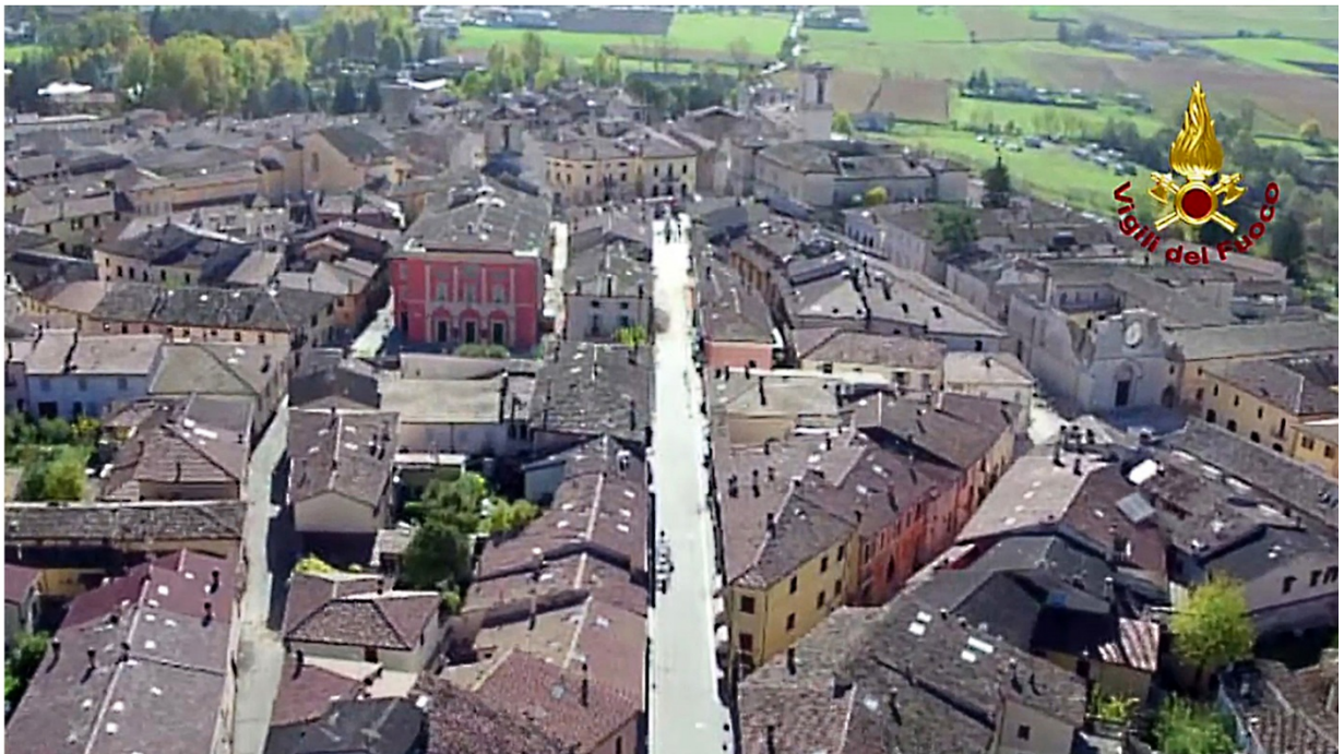
Fig. 9. a) Amatrice, after the 24 th August event. b) Norcia, after the 30 th October event. Snapshots from the movies released by the Firefighters Corps ( www.vigilfuoco.tv ).

Personal communication by an old person in one of the small settlements within the municipality of Amatrice conveyed that at least until 60-70 years ago wall construction took place manufacturing mortar from a soil pit where the excavated ground was mixed with water until proper plasticity was achieved. This statement has been confirmed by preliminary studies on mortars from the area of Amatrice, which are composed of a binding fraction mainly constituted by clay minerals, sometimes stabilised by the addition of small aliquots of aerial lime poorly mixed with a soil fraction. Furthermore, mortars' aggregate is often constituted by the sole coarse fraction of the natural soil employed as binder, with consequent poor optimization both of its compositional and granulometric characteristics and proportions with the binder itself. The final result is a set of binding materials with scarce cohesive properties and inadequate adhesive properties with the masonry units, giving at the same time poor stability to the walls due to the swelling characteristics of clays when subjected