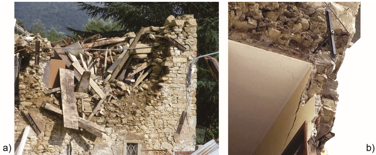
Fig. 13. Collapse of a masonry building having steel ties combined to poor mortar. a) Amatrice, Petrana; b) Arquata d/T, Piazza Umberto I.

These mortar characteristics could at least partially explain the performance found after the 24 th August event, worse than that of the 2009 L’Aquila Earthquake. Additionally, several experiments show that undressed natural stone with proper mortar can have substantial seismic strength (e.g., Magenes et al. 2014; Silva et al. 2014; Giaretton et al. 2017). If disintegration due to poor masonry quality occurs any modelling of building response becomes unreliable (Sorrentino et al. 2017). As shown in Fig. 13, when masonry has such a low strength even the systematic use of steel ties is ineffective. When combined with a reasonable quality masonry, steel ties certainly contributed to preventing collapse (Fig. 3, Fig. 8). Nevertheless, besides the low masonry quality, the limited presence of connections in many buildings, the reduced strength of lateral walls compared to large-units wall intersections (Fig. 14), as well as the presence of intermediate floors having scarce diaphragm effect, poor details at the bearings, and no connections to the walls parallel to beams, should be recalled (Fig. 6).