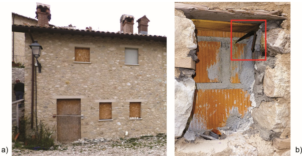
Fig. 18. Demolished and rebuilt clay block masonry with connected natural stone veneer. Norcia, Castelluccio di Norcia. a) General view, b) close up of a cavity, with clay block and connection rebar visible within the red frame.