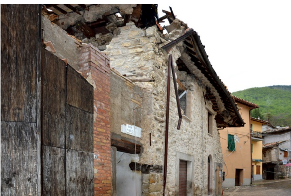
Fig. 15. Replaced reinforced concrete roofs: a) Arquata del Tronto, Pescara del Tronto; b) Amatrice, San Tomasso.