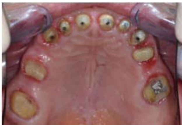
Fig. 1. Occlusal view of clinical situation.