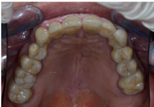
Fig. 4. Clinical situation on the day of final restoration.

The CS 3500 CareStream® system has demonstrated an acceptable level of accuracy and precision for prosthetic rehabilitation on natural teeth. The combination of digital impression technology and the use of the monolithic zirconia has enabled the delivery of the final prosthetic device in a quick time and without the need to remodel neither functional nor aesthetic. The clinical outcome was hopeful and a the long term evaluation is needed.