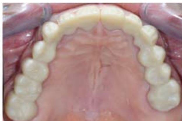
Fig. 3. Occlusal maxillary arch frameworks with monolytic zirconia

impression taking with an intraoral optical scanner (CS3500, Carestream Dental, Atlanta, GA, USA) (Fig.2), dental gingival retraction cord was inserted in the gingival sulcus. The system CareStream CS3500 does not require a matting powder and is characterized by a scan with an inclination up to 45° and with a depth of field from -2 mm to +13 mm. The acquisition software was the CS3500 Acquisition, it requires 50% of images' overlapping taken in sequence to facilitate the matching work. The scans were performed without the use of artificial light sources. At the end of each scan the "cloud of points" has been processed by a software which has generated a polygon mesh representing the digital impression, which has been developed in a virtual STL model. To evaluate the accuracy of the scanner, the STL model was compared to an STL model derived from the scan of the master model obtained using a laboratory extraoral scanner Sinergia Scan, produced by Nobil Metal s.p.a. which uses the Optical RevEng Dental 2.5 as acquisition software that has measured the alignment error between the models with a precision of the order of 0.001mm (1 μm). 10 digital impressions were detected. A mask was realized for each prosthetic pillar and the alignment error between the master model and each STL model was calculated (Tab.1). For the evaluation